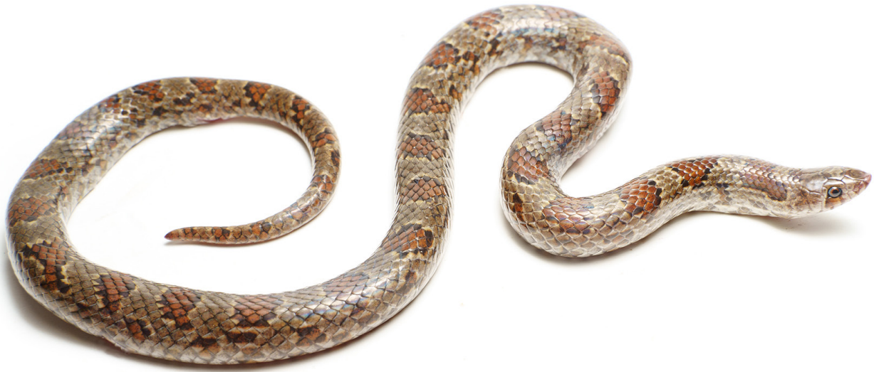
Figure 2. Specimen of Ficimia publia reported herein.